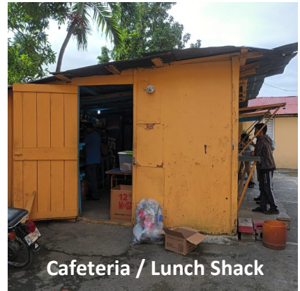
Cafeteria / Lunch Shack

We praise the Lord for the work that has been done and for the $24,000 the Lord has already provided for the conference. Please continue to pray for God to supply the $26,000 still lacking to cover our $50,000 budget for this project.